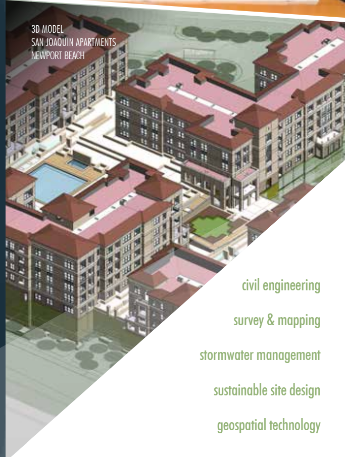
3D MODEL SAN JOAQUIN APARTMENTS NEWPORT BEACH

civil engineering survey & mapping stormwater management sustainable site design geospatial technology